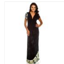
Santiki Women's Honor Dress BLACK