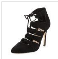
Honor Suede Lace-Up Bootie, Black -...