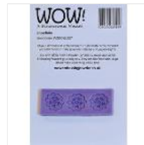
WOW! 3D Molds-Snowflake