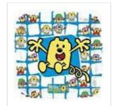
18 Wow Wow Wubbzy Character